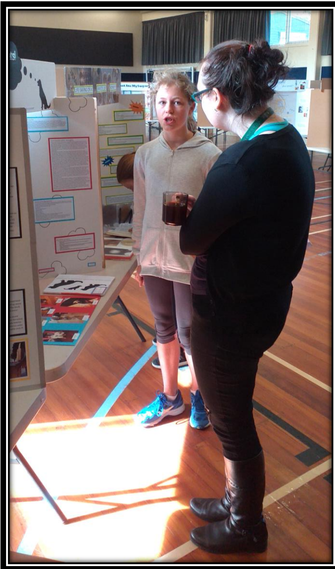
Explaining your science fair question and research to the judges.

Four judges from Victoria University carefully considered all entries in this year's Science Fair before selecting the top 20 entries to be entered in the NIWA Science Fair.