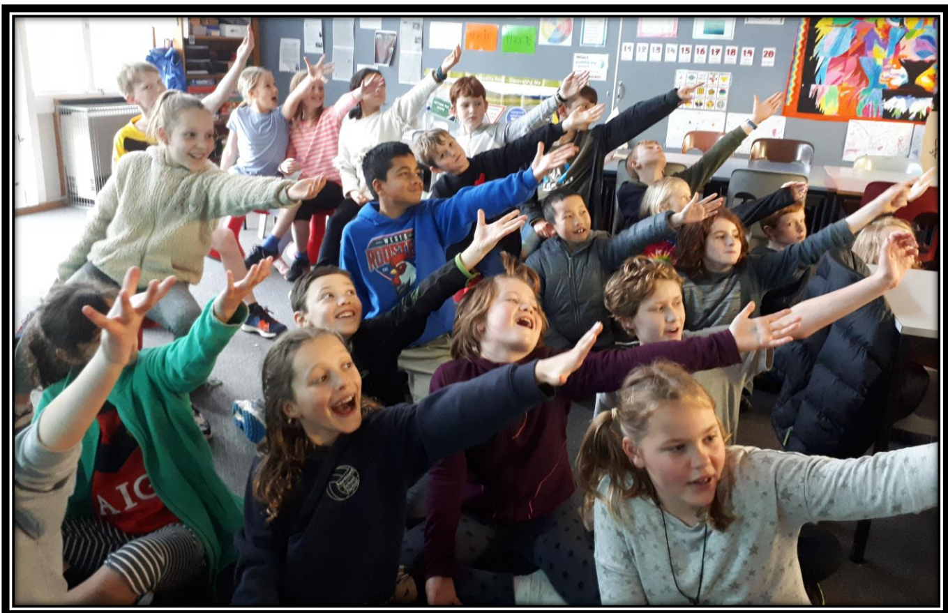
Singing, dancing, learning left from right – lots and lots and lots of practising

Information has already been shared with families about costumes. If you are unable to source the requested items please contact your child's teacher.