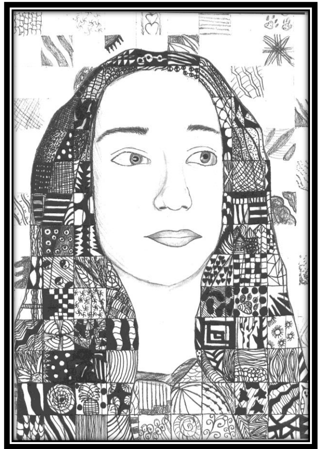
Self Portrait by Year 8 Student